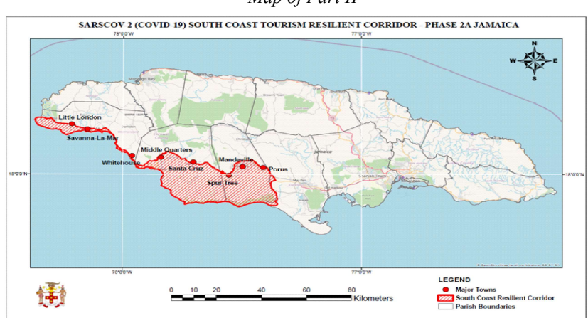
Map of Part II

The boundary takes into consideration the main road to the sea shore and hotels and resort cottages and tourist attractions that have direct access on the landward side of the main road.