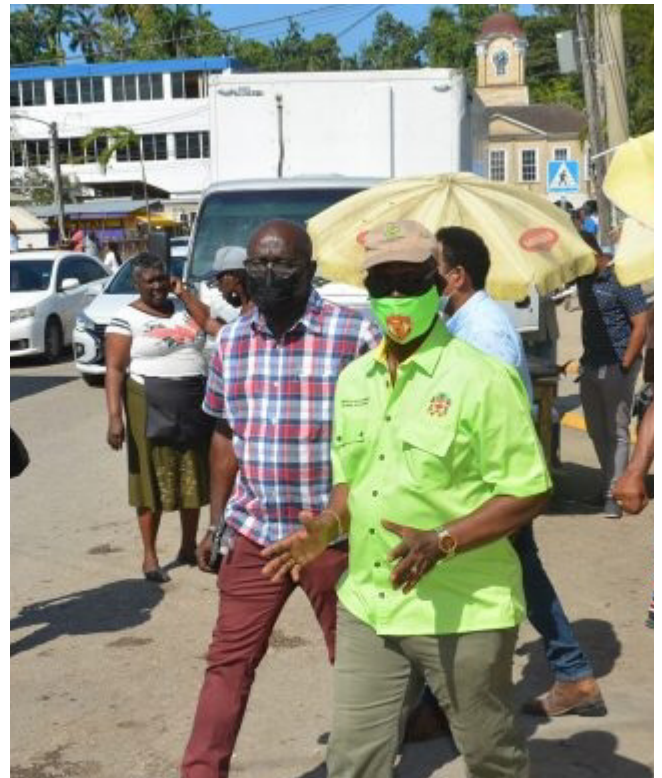
HON. DESMOND A.A. MCKENZIE, CD, MP, JP

The beautification project, which was announced by the Minister of Finance and the Public Service during the 2021/2022 Budget Debate, forms a part of the Government's plan to drive the development of rural Jamaica and is to be executed over a three-year period.