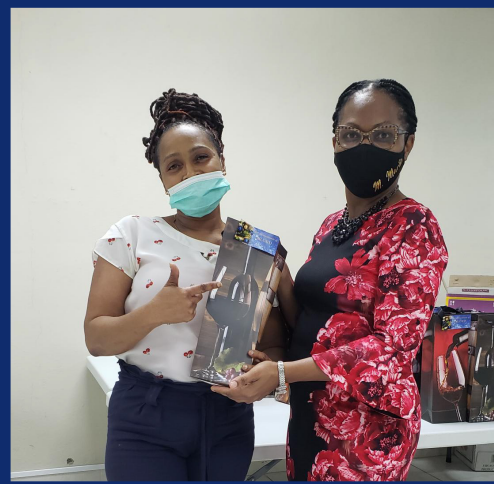
Highlights of the Ministry's End-Of-Year Staff Activity in December 2021'