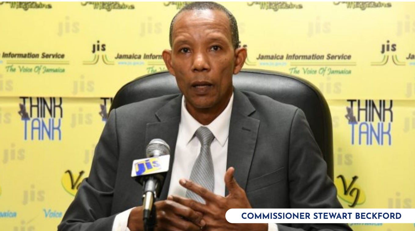
COMMISSIONER STEWART BECKFORD