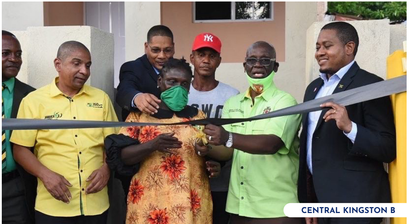
CENTRAL KINGSTON B