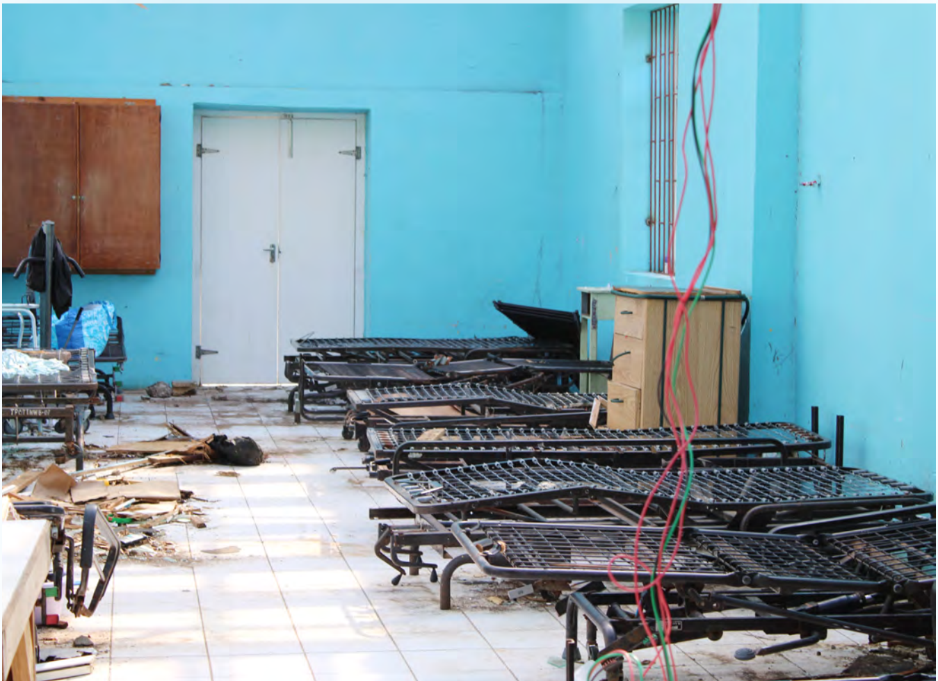
One section of the Trelawny Infirmary following Hurricane Melissa.

He assured vendors that during the rehabilitative period, vendors will enjoy a market fee waiver, as the community works together to recover from the devastating blow of Hurricane Melissa.