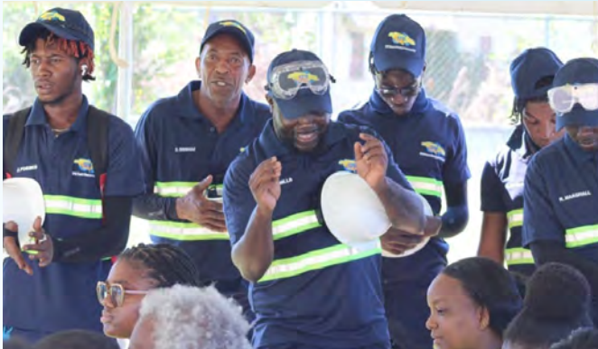
Sanitation workers from the SPM branch of the NSWMA prepare for a clean-up exercise at the Santa Cruz Infirmary.

This joint effort came as sections of the infirmary were badly damaged after the property was submerged in flood waters and the roofs of the female ward, canteen and storage areas were destroyed. During the workday exercise, the roofs were repaired, debris removed as well as a comprehensive wash down of the facility.