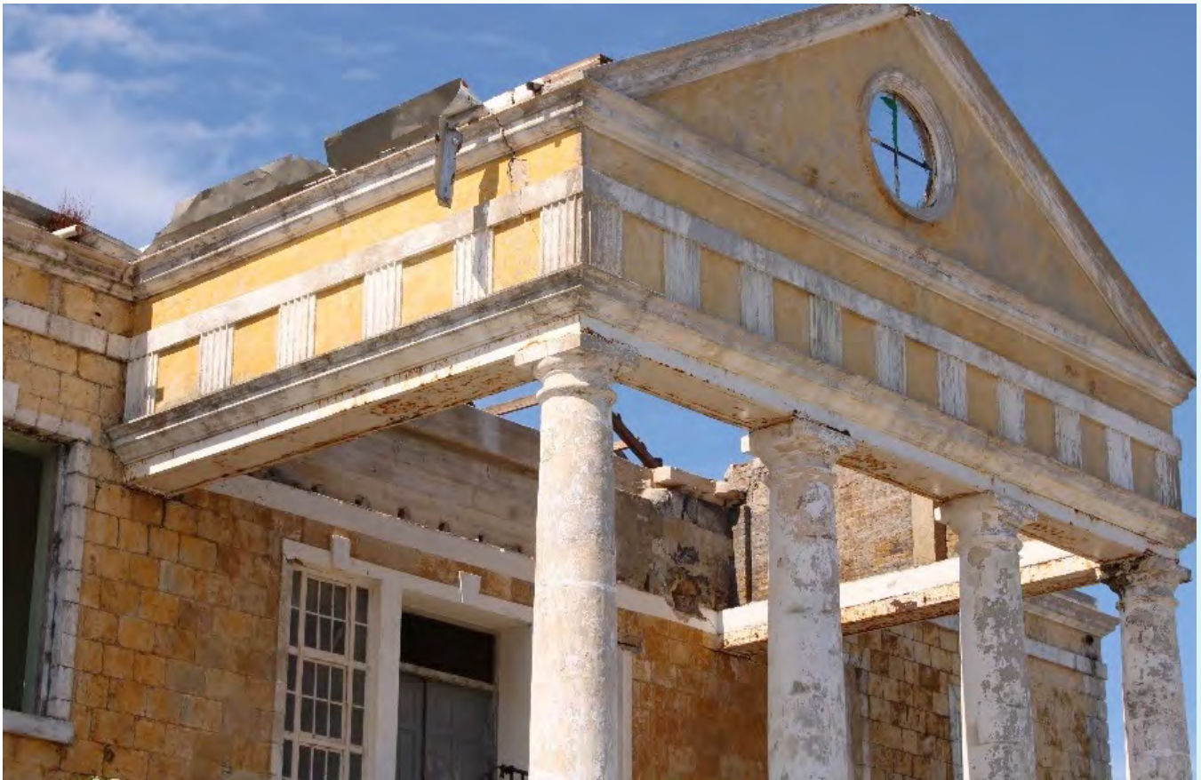
The Falmouth Court House and Council Chamber following Hurricane Melissa.