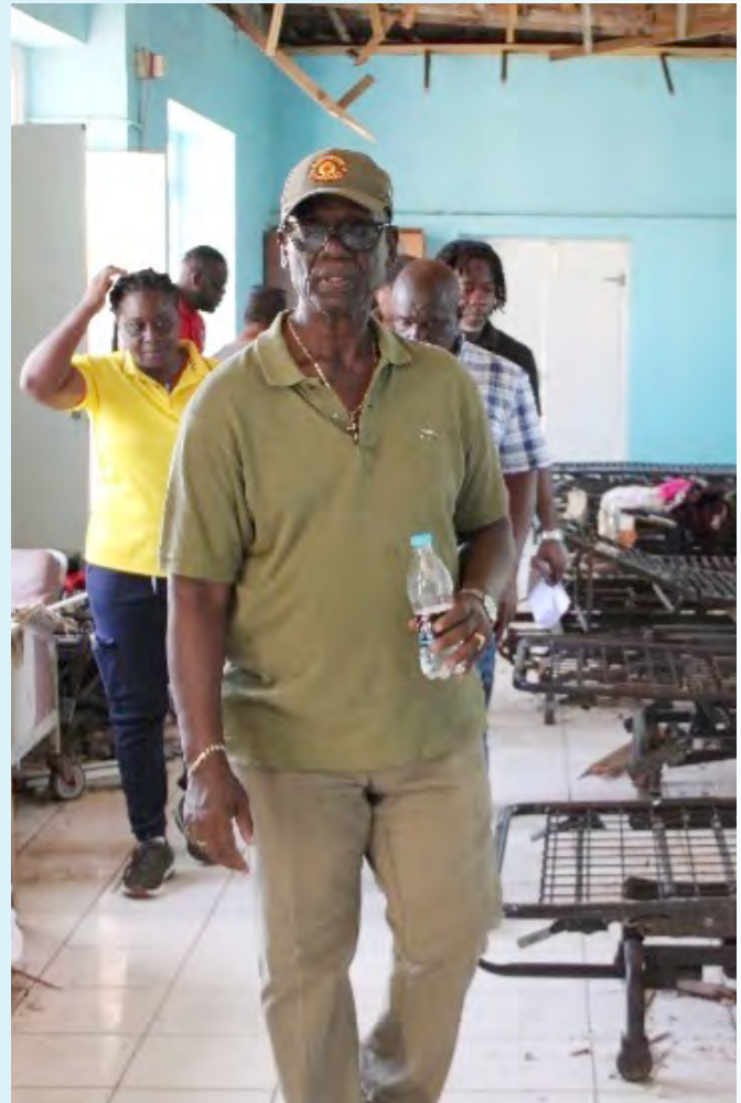
Hon. Desmond McKenzie tours the Trelawny Infirmary following Hurricane Melissa.

"This is more than a joy to me this morning to be here and to see what you have helped us to achieve... We will make sure we will try to do our best because we do want to get back on our feet, we do want to be able to earn again so this coming in, it is a blessing to us," he said.