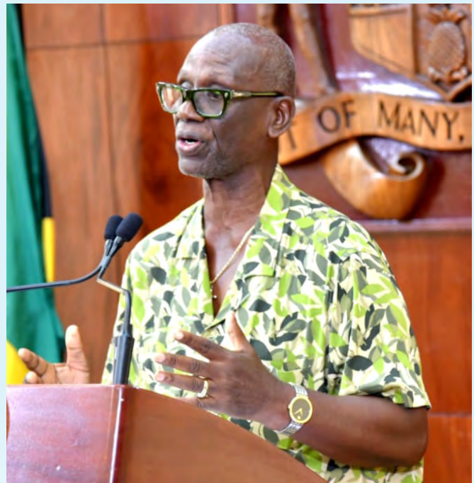
Hon. Desmond McKenzie making his presentation at a special post-Hurricane Melissa Press Briefing.

"One of the first signs of their commitment to working with the Government and the people of Jamaica is a visit to the Transitional Centre in Kingston where the homeless population is, where they will be providing care package to the homeless population," Minister McKenzie continued.