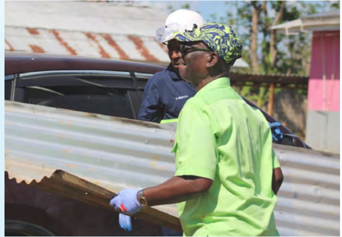
Hon. Desmond McKenzie removes debris from the Santa Cruz Infirmary with the help of a sanitation worker from SPM Waste Management Limited.

The Minister said that at least five infirmaries across the countries were affected during the passage of